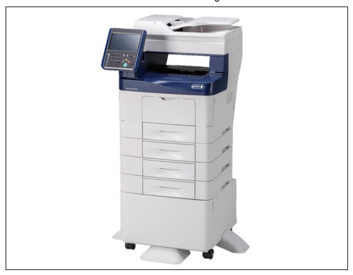
Figure 1: Xerox® WorkCentre® 3655/3655i 2016 Xerox® ConnectKey® Technology

The TOE can integrate with an IPv4 network with native support for DHCP. The hardware included in the TOE is shown in the figure below.